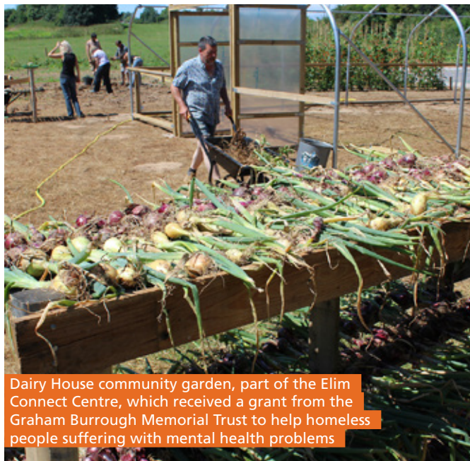
Dairy House community garden, part of the Elim Connect Centre, which received a grant from the Graham Burrough Memorial Trust to help homeless people suffering with mental health problems