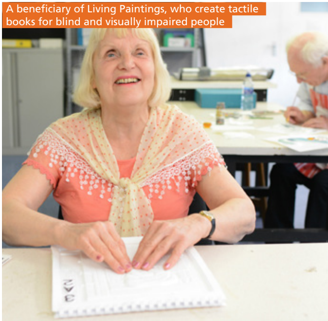
A beneficiary of Living Paintings, who create tactile books for blind and visually impaired people