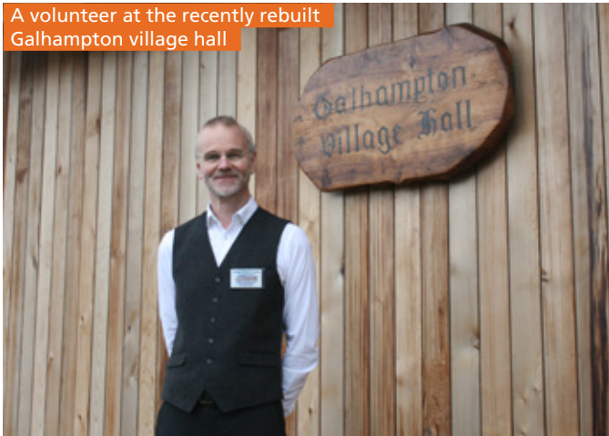
A volunteer at the recently rebuilt Galhampton village hall