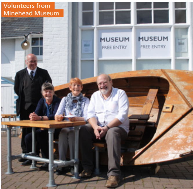
Volunteers from Minehead Museum