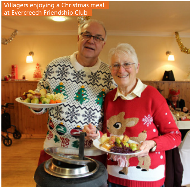
Villagers enjoying a Christmas meal at Evercreech Friendship Club

Supporting an area or theme: We have more than 90 pre-existing funds supporting different geographical areas or types of work, such as youth or older people. Donors may name an existing fund, geographical area, or theme of work in their Will and be confident that it will be used effectively.