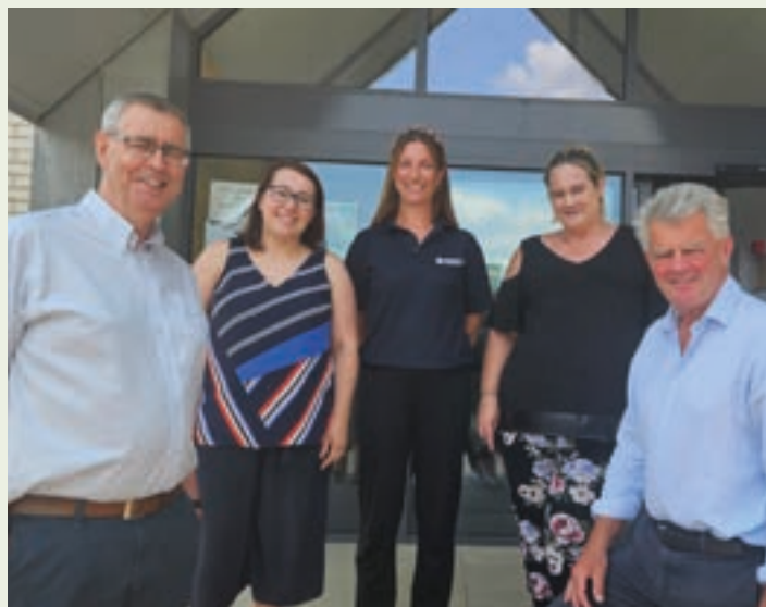
Staff from Somerset Community Foundation, Hunt's Food Group and Westfield Community Centre on a recent visit.

In its first year, the Fund awarded £130,000 of grants – supporting 5 charities across Somerset and Dorset in communities where the company's staff live and work over 3 years. These long-term grants will help the charities plan for the future and invest in their core running costs, supporting them to continue their fantastic work.