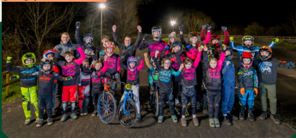
► Burnham BMX Club: gearing up for fun in Somerset