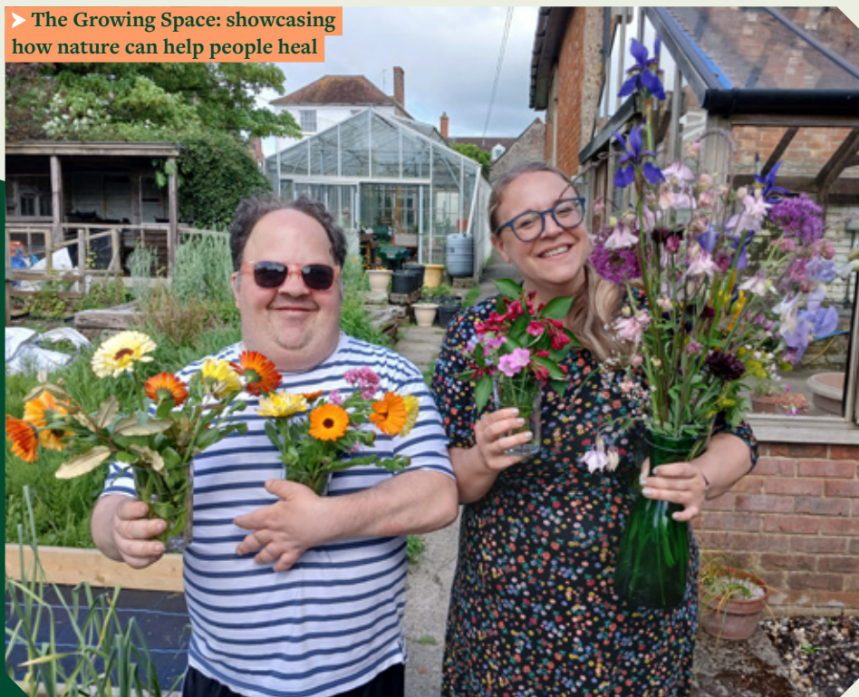
➤ The Growing Space: showcasing how nature can help people heal

“And they said that having not stopped for the last 20 years it was the first time they hadn’t looked at their watch and wished the day away.”