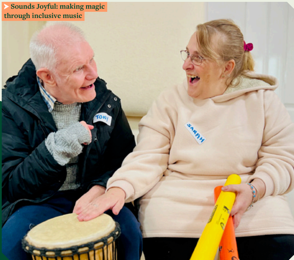
► Sounds Joyful: making magic through inclusive music

“And yesterday I could really see the empathy build between the group as we played. It was magical.”