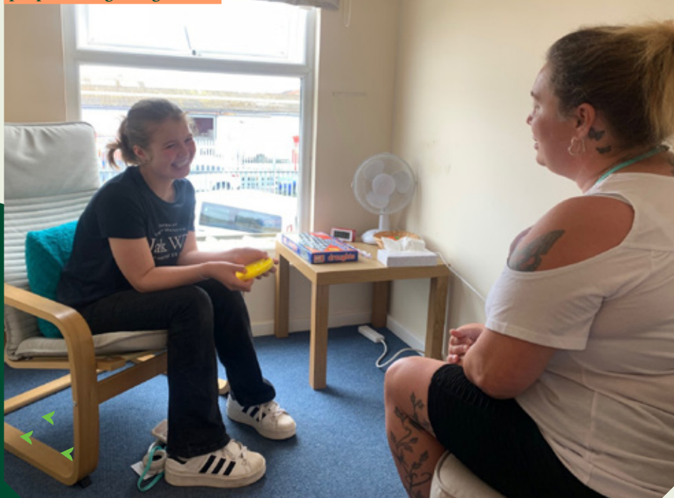
► In Charley's Memory: supporting young people through tough times