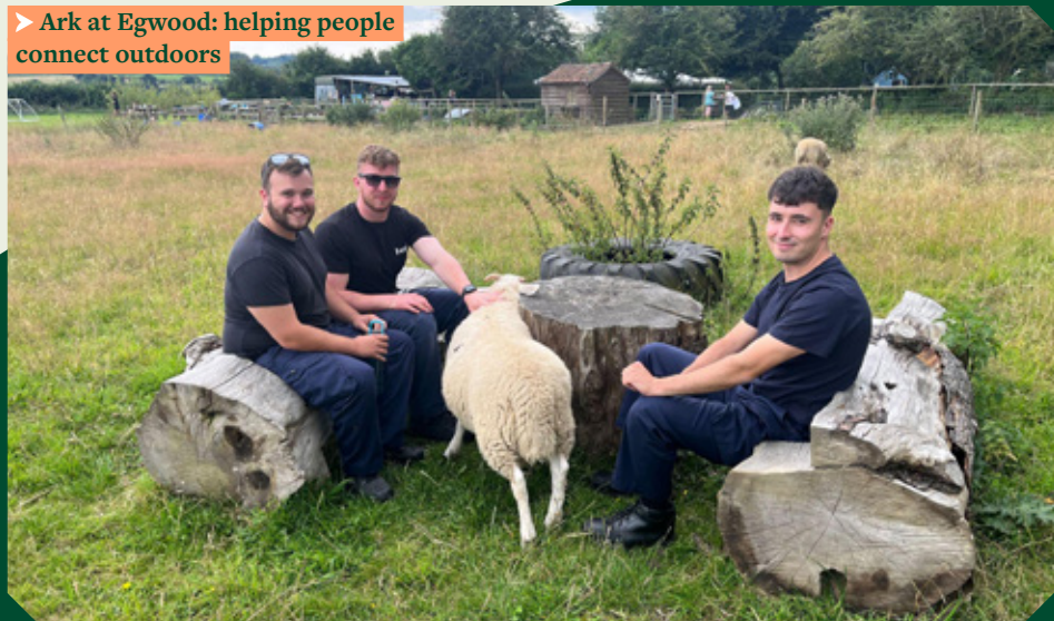
➤ Ark at Egwood: helping people connect outdoors