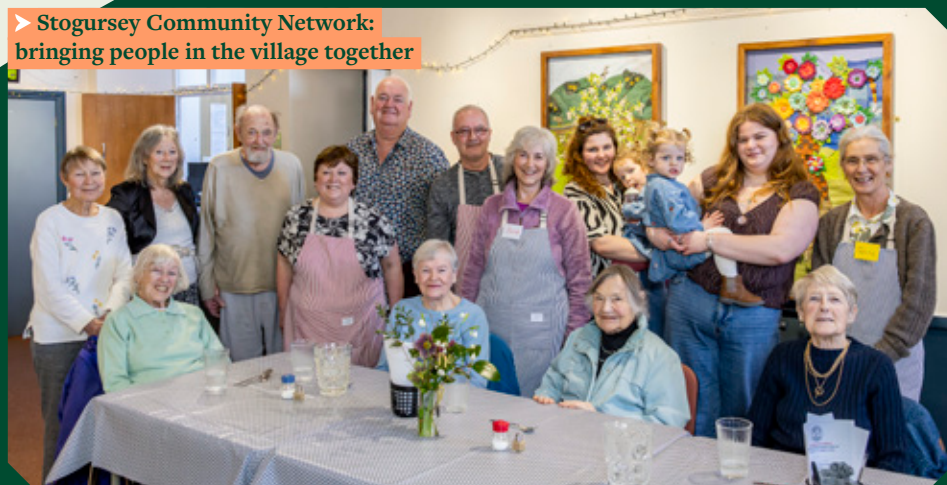
➤ Stogursey Community Network: bringing people in the village together